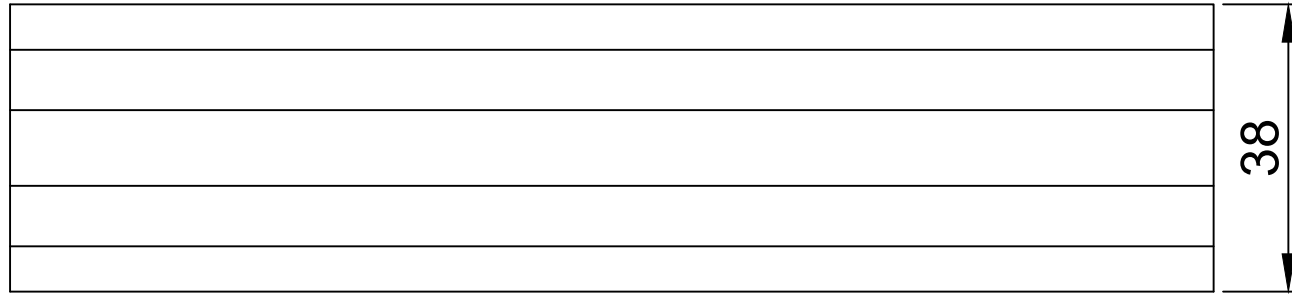
Front Scale 1:1